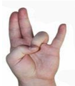
Figure.03: shocker sign

The shocker is a hand gesture with a sexual implication. This gesture is performed by ring finger and thumb is bent down while the other fingers are extended upwards. It means that two fingers in your elastic muscular canal that extends from the cervix to the vulva and little finger in to the anus.