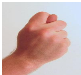
Figure.02: Fig sign

Fig sign hand gesture may have originated in ancient Hindu culture to represent the lingam and yoni. Among early Christians, it was known as the manus obscena , or "obscene hand".