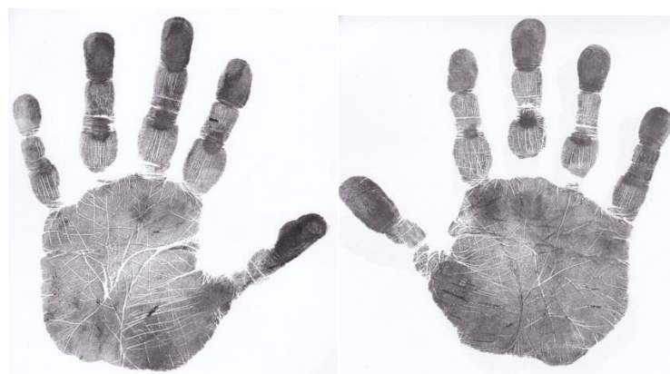
Figure.07: Left and right hand of an actor who have strong sexual desire Unmarried / primitive sexual behaviors can be seen (My case No HA0056)

who is sexually active always (My case No HA0132)