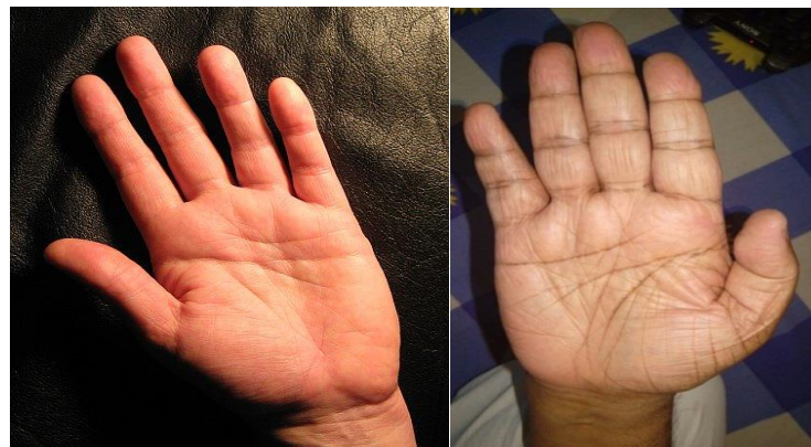
Figure.05: Hand of a Porn star

Few examples for different types of sexual behaviors and desires: