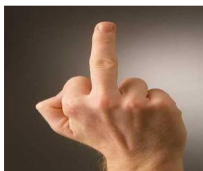
Figure.01: Reversed hand with middle finger extended

Extending the finger is considered a symbol of contempt in several cultures. The middle finger gesture was used in Ancient times as a symbol of sexual intercourse. Sometimes it shows disrespect, and is roughly equivalent in meaning to "fuck off", "fuck you", "shove it up your ass", "up yours" or "go fuck yourself". There is another meaning of this gesture. The index finger and ring finger besides the middle finger in more contemporary periods has been likened to represent the testicles. This gesture is performed by showing the back of a hand that has only the middle finger extended upwards. See figure 01